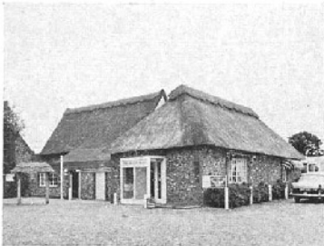
(The Stores at the water's edge)

You must visit the 16th Century thatched malt-houses now converted into THE MOST MODERN AND HYGIENIC SELF-SERVICE PROVISION STORES, EXCLUSIVE GIFT SHOP AND BUFFET, combined with friendly and courteous service right on the Staithe at the biggest and best free moorings on the Broads. In the BUFFET you can be served with hot and cold meals, chicken soups, milk shakes, sandwiches, tea, coffee, sandwiches, etc., etc. Our GIFT SHOP offers an interesting selection of good quality gifts at reasonable prices. Newsagents, films, books, cigarettes, etc., etc. Blakes ice-box free exchange service. Yachtmaster Credit Cards. PIPED WATER ON STAITHE.